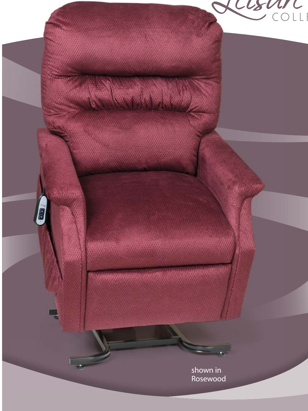
shown in Rosewood